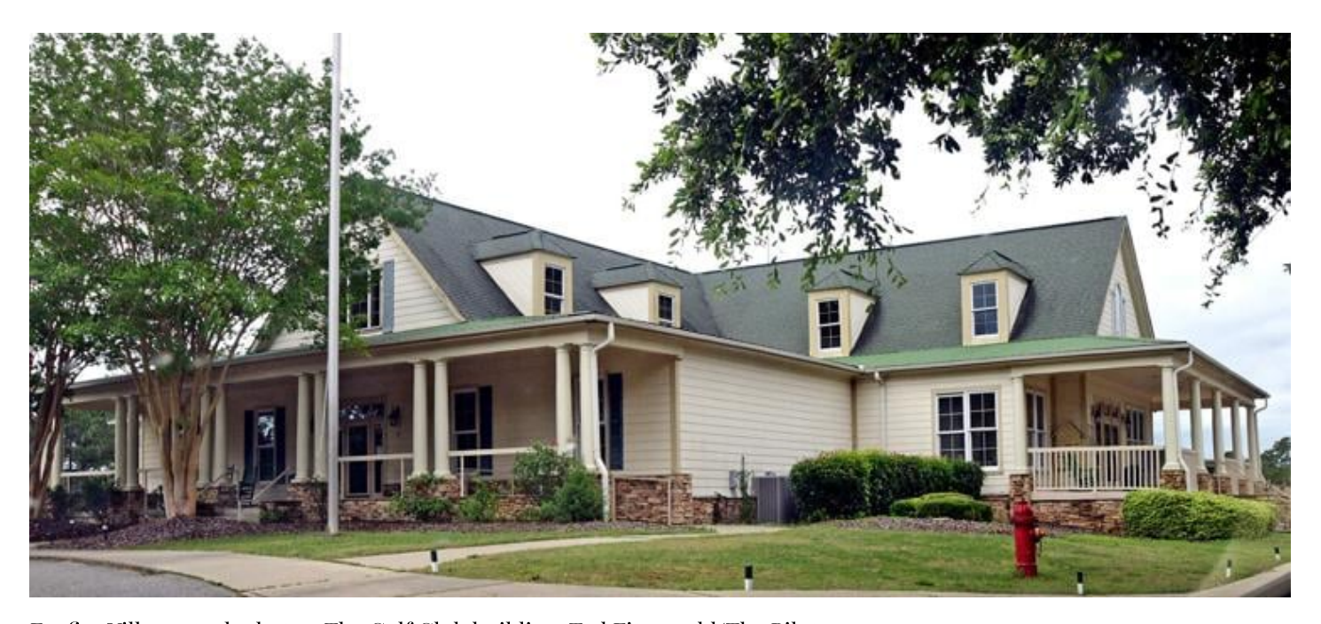
Foxfire Village stock photos. The Golf Club building.

The clubhouse at Whispering Pines is 25,302 square feet, and includes a pro shop, banquet facilities and the recently renovated bar and grill branded as The Bell Tree Tavern - Whispering Pines. An adjacent 4.58-acre parcel with three golf villa buildings, a swimming pool complex, and tennis courts also could be used for redevelopment.